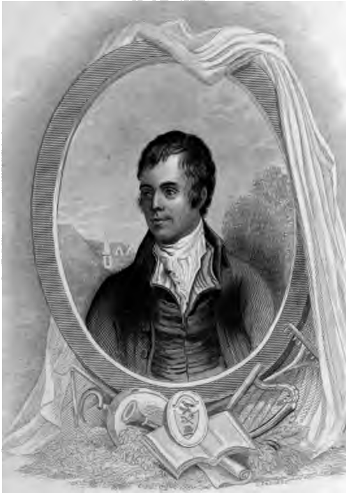
Robert Burns. Port.