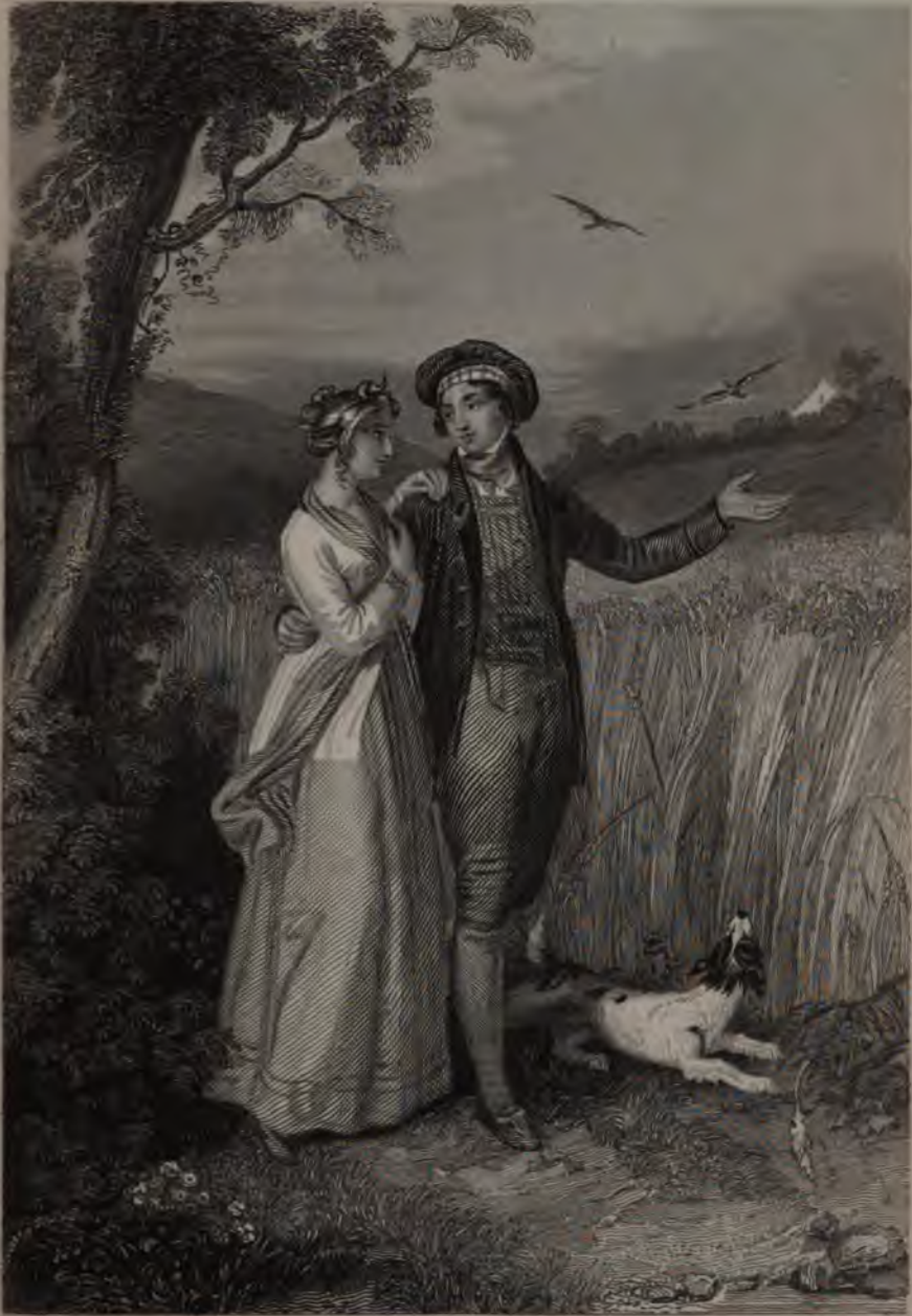
HOW WESTLIN WINS.